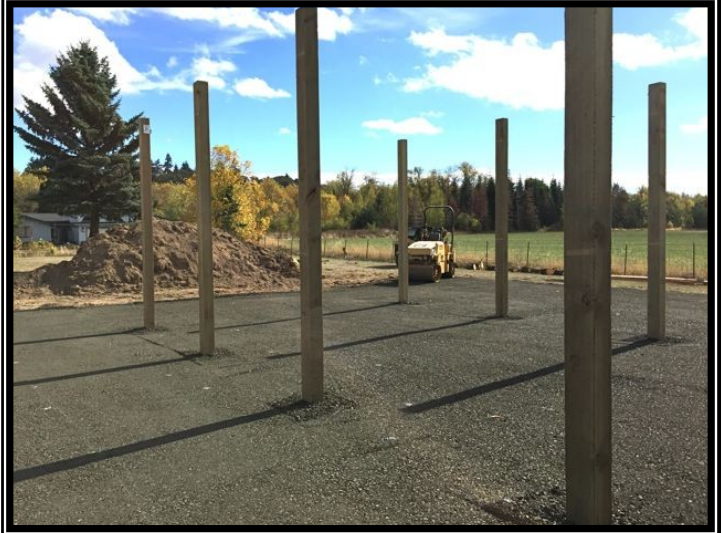
The Patio Project, October 18, 2015.

The patio project is off to a good start. With some pre-planning we were able to schedule work to be done in anticipation of a favorable vote to proceed with the project. Fortunately, we did not need to cancel these plans. We were able to beat the rain and get most of the heavy work done before things got too muddy. Posts for the gazebo have been placed and we plan to tie the posts together with top beams. The roof will have to wait until spring. We need to route some conduits for electrical and pipes for water but the gravel is compacted and in place and is ready for concrete. There are still a few design details to be worked out so the patio committee will continue to meet to work out more details. If you have feedback for the patio committee; Members include Walt Held, John Leach, Carole Gutbrod, Carla Rhodes, Karen Motlok, Jim Reams, Jan Lane, and Bob Glathar.