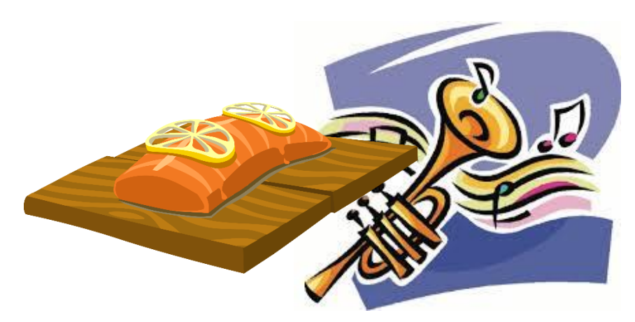
Salmon & Jazz

We are going to need everyone's participation is helping us to keep our church clean. As we empty out the various rooms and organize the necessities we are asking that the areas we empty, remain empty. We have experienced an issue with individuals dropping off or simply placing items on an empty surface instead of putting it away. This will no longer be acceptable practice. Please ask for help right away if you need assistance putting something in the attic...or if you think something would be a nice addition to our necessities.