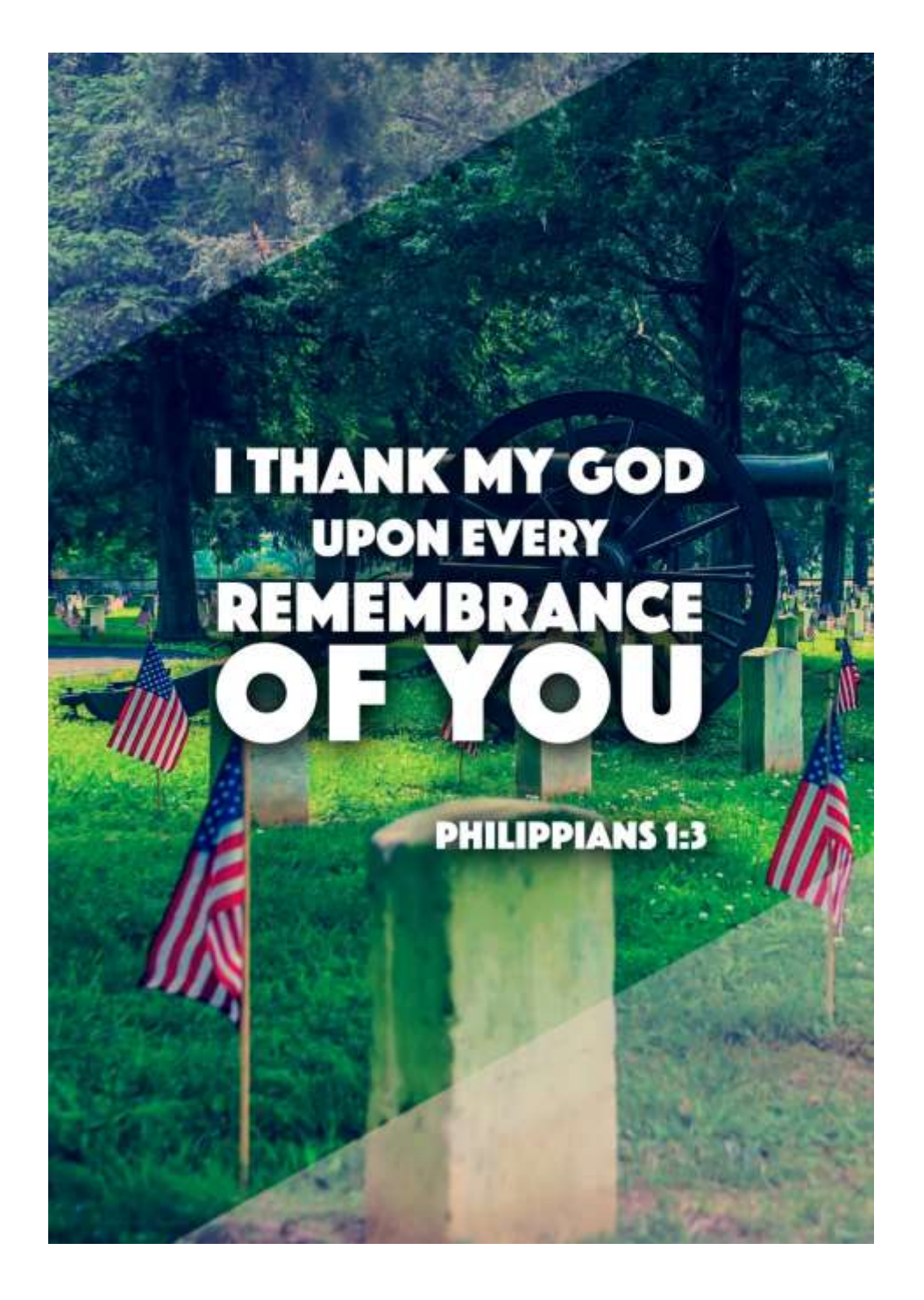
SIXTH SUNDAY OF EASTER May 25, 2025